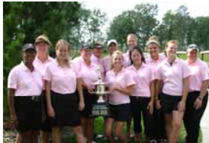
The Public Team put up a valiant fight