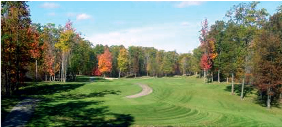
This time of the year, The Dream really is something to dream about.

Turkey day is over and I hope all enjoyed the food, family and friends. The tournament committee worked tirelessly up until just before the holiday to make MWGA's 2012 season one that will be hard to ignore. We are revisiting some of our recent favorites like Salem Hills, Shepherd's Hollow, Dunham Hills and Sycamore Hills. And we're returning to other choice courses that we haven't played in a while like Lakes of Taylor, Lake Forest and Timber Trace.